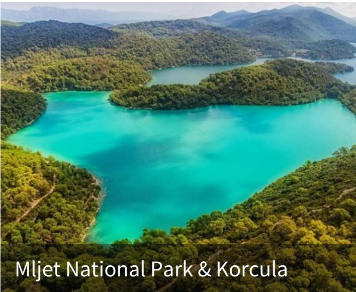
Mljet National Park & Korcula