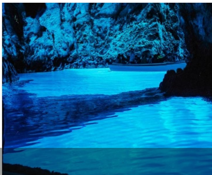
Blue Cave & Stari Grad (Hvar)

Today we continue to the stunning island of Hvar which is renowned for its stunning and fragrant fields of lavender fields. On route, we stop at Bisevo Island to explore the breath-taking Blue Cave. This is truly a natural marvel, a sea grotto of illuminated light. Enjoy a guided boat tour within the cave to experience this beautiful phenomenon. Please note that entry to the Blue Cave is subject to weather and sea conditions and therefore the entry fee of EUR25pp is payable on the day. After exploring the Blue Cave and enjoying a delicious lunch on board, we continue to the peaceful port of Stari Grad in Hvar. On arrival, enjoy a wine tasting tour at a very sought-after family winery, followed by free time to explore the beautiful town of Hvar at your leisure. You can choose to remain in Hvar Town which is known for its vibrant restaurant and nightlife scene or return to Stari Grad and enjoy a more tranquil alfresco dining experience.